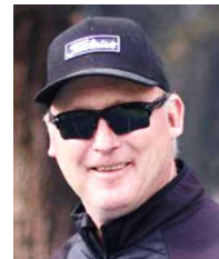
Steve Matthews Tennis